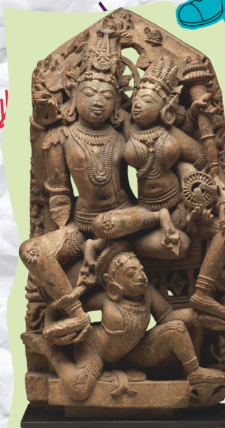
Stele with Vishnu and Lakshmi

Is there a relationship in your life that brings you joy?