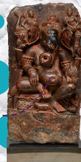
Stone Statue of Ganesha

Like Parvati, who are the motherly figures that have helped you along your journey?