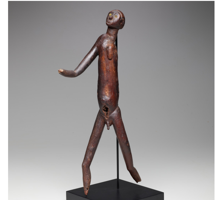
Dancing Figure, Tanzania, Sukuma or Nyamwezi peoples, 1900–1950. Wood. African Collection Fund, 2021.14.