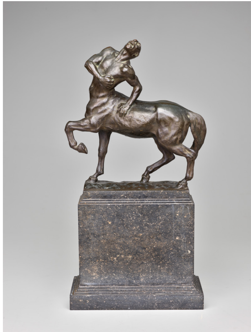
Franz von Stuck, Wounded Centaur , about 1890–1893