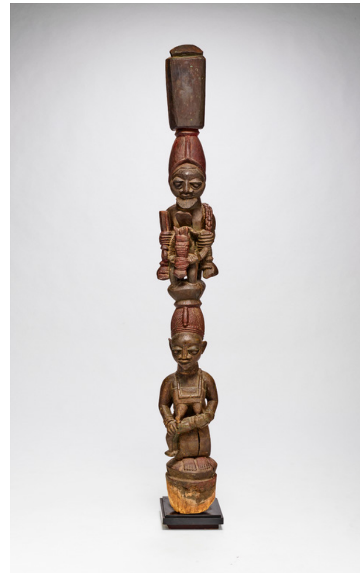
Agbonbiofe Adeshina, Yoruba peoples, Veranda Post (Opo), early 20th century, 1890–1930