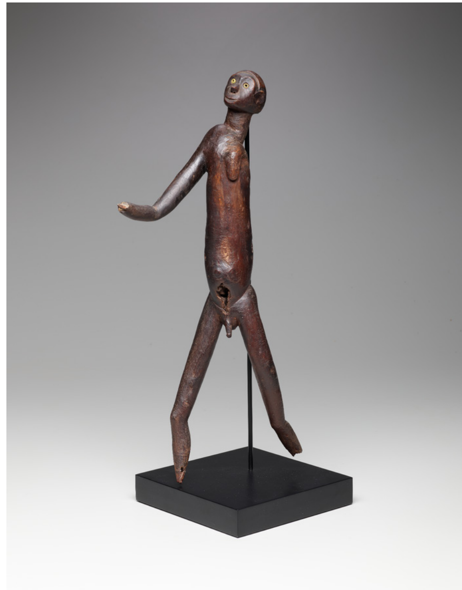
Sukuma or Nyamwezi peoples, Dancing Figure, early–mid 20th century