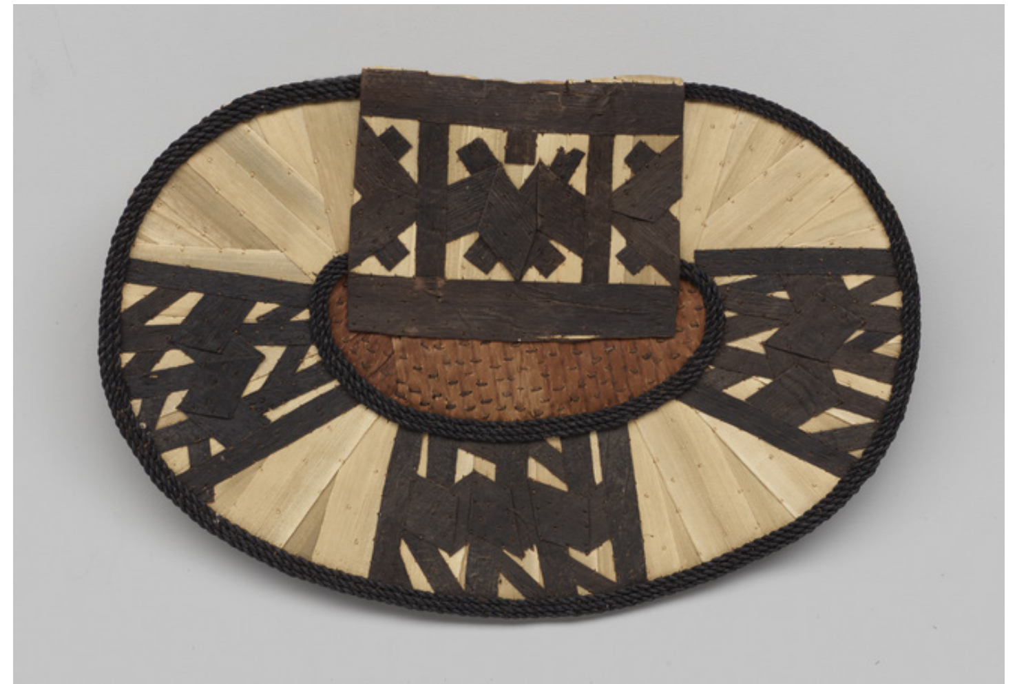
Democratic Republic of the Congo Mangbetu peoples, Back Apron (Negbe), 1930s