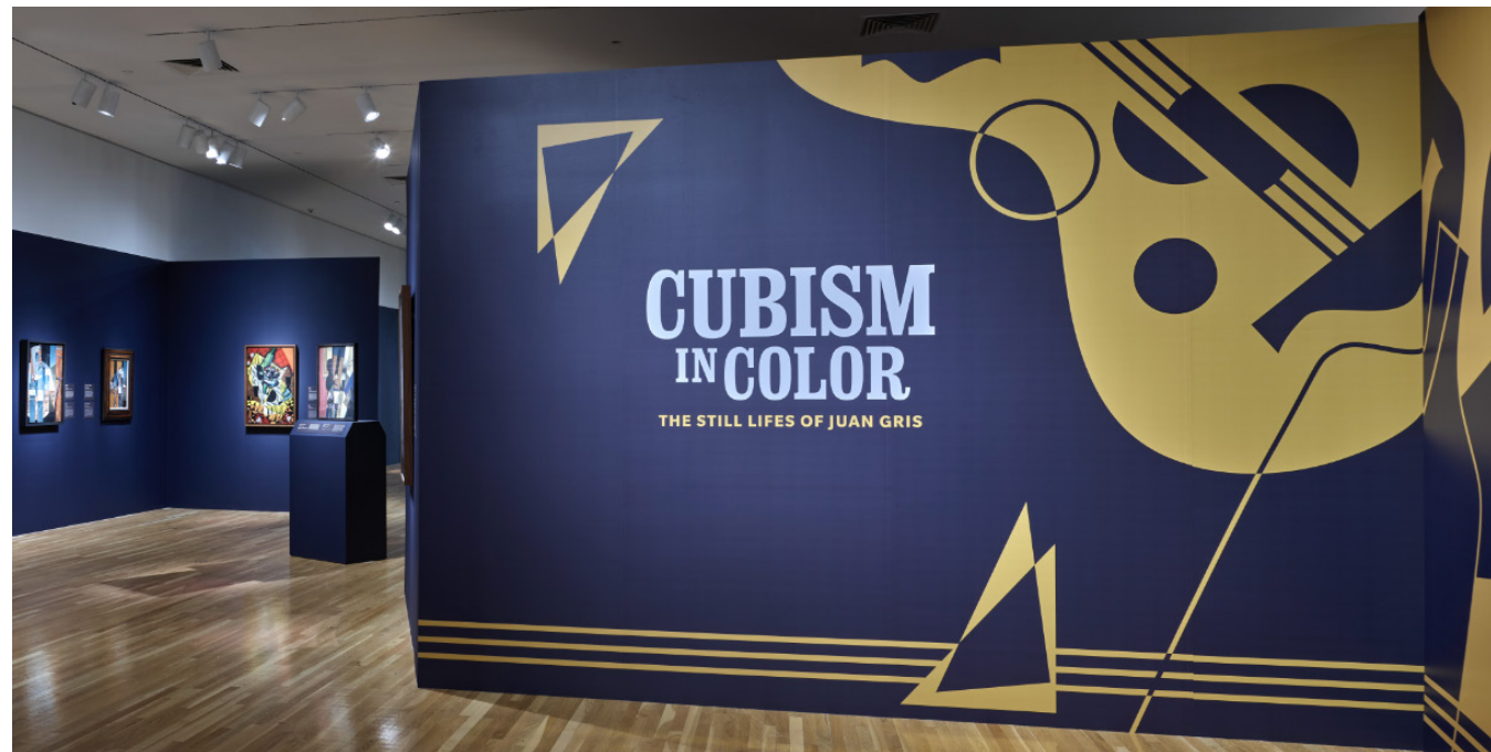
Cubism in Color: The Still Lives of Juan Gris presented work by the revolutionary Spanish artist in the first US exhibition dedicated to Gris in nearly 40 years.