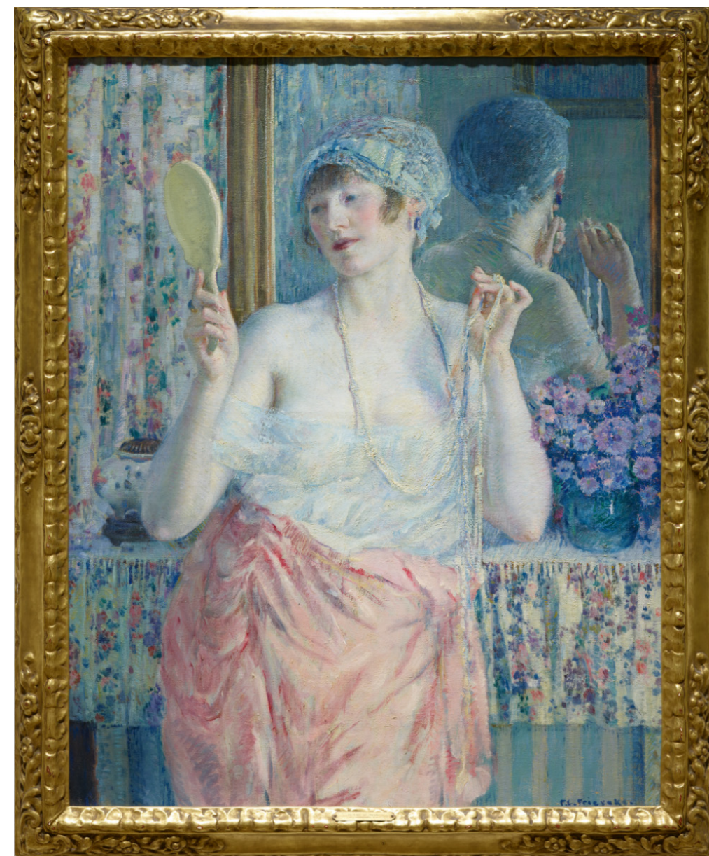
Frederick Carl Frieseke, Woman Before a Mirror , about 1912