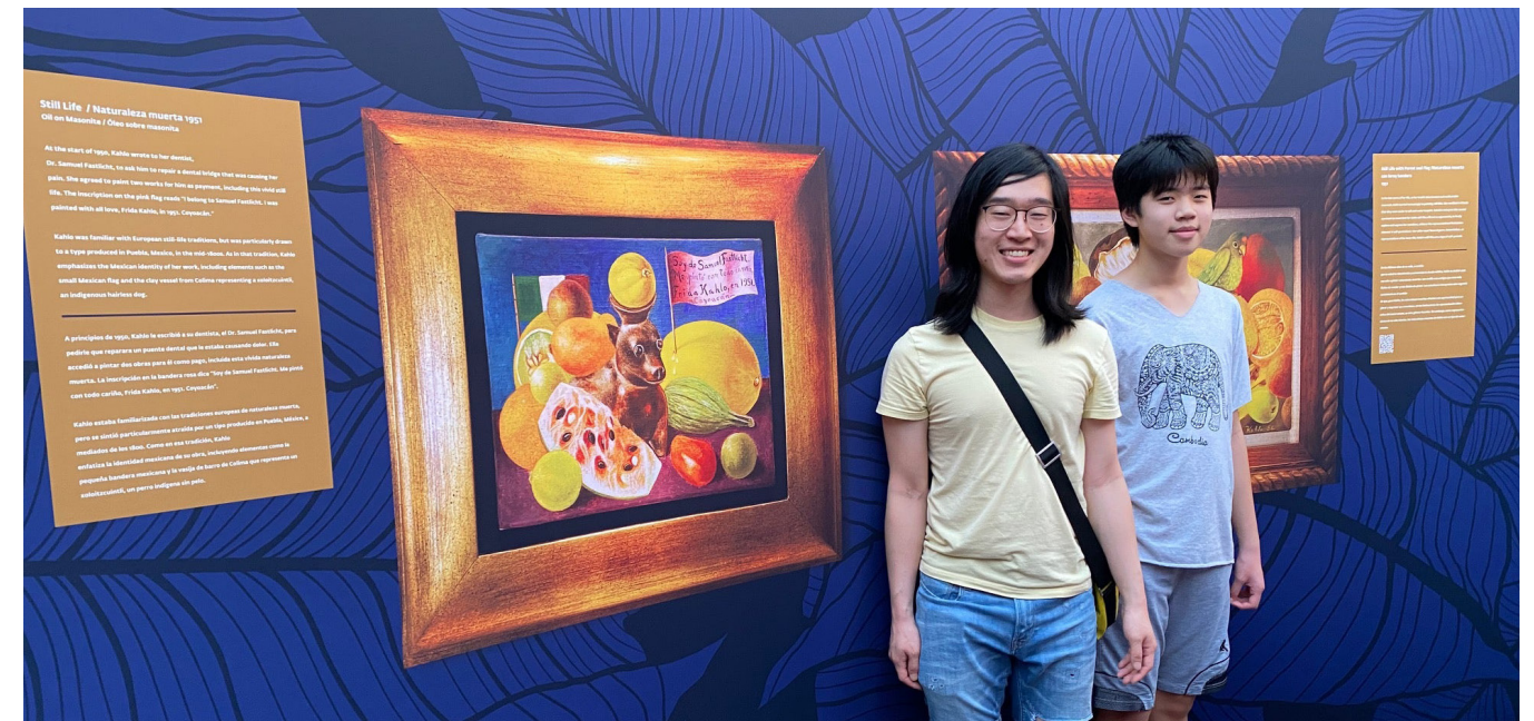
We not only provided our visitors with the rare chance to see works by the iconic Mexican painter in Frida Kahlo: Five Works , but we brought the exhibition out to the community with experiential pop-up spots. Encouraged by the years' events to think beyond the walls of the Museum, we ensured that all exhibitions that opened during the 2020–2021 fiscal year were accessible for anyone, anywhere, to view on virtual.dma.org , with dedicated webpages that featured a virtual tour and rich additional content.