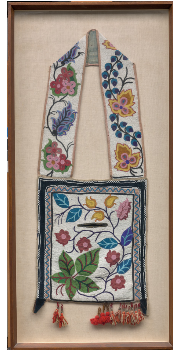
Anishinaabeg, Bandolier Bag, about 1900