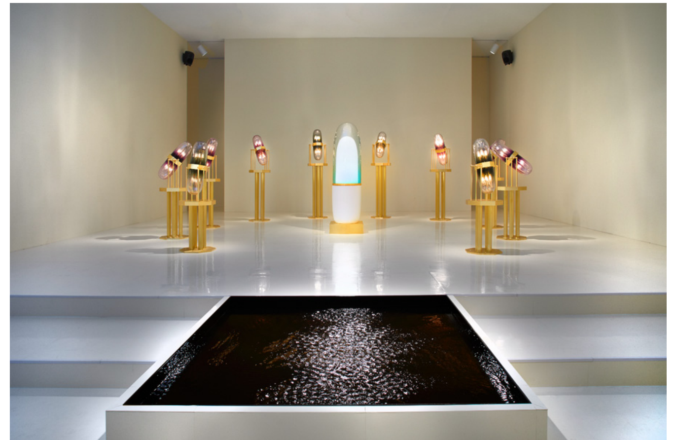
Ini Archibong, theoracle , 2019