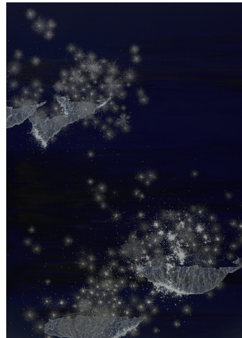
Sandra Cinto, From Landscape of a Lifetime - C5 , 2019