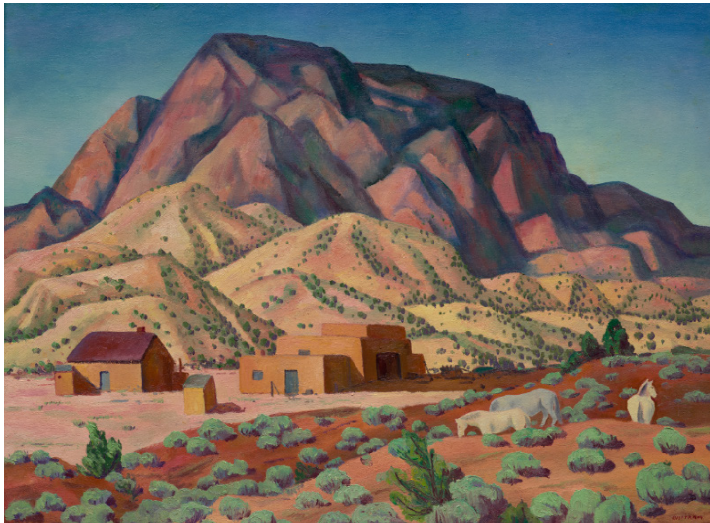
Emil J. Bisttram, Untitled [New Mexico Landscape] , date unknown