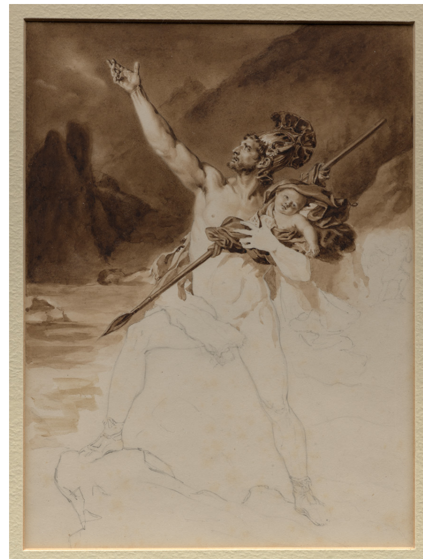
French School, Warrior with Infant , 1700–1800