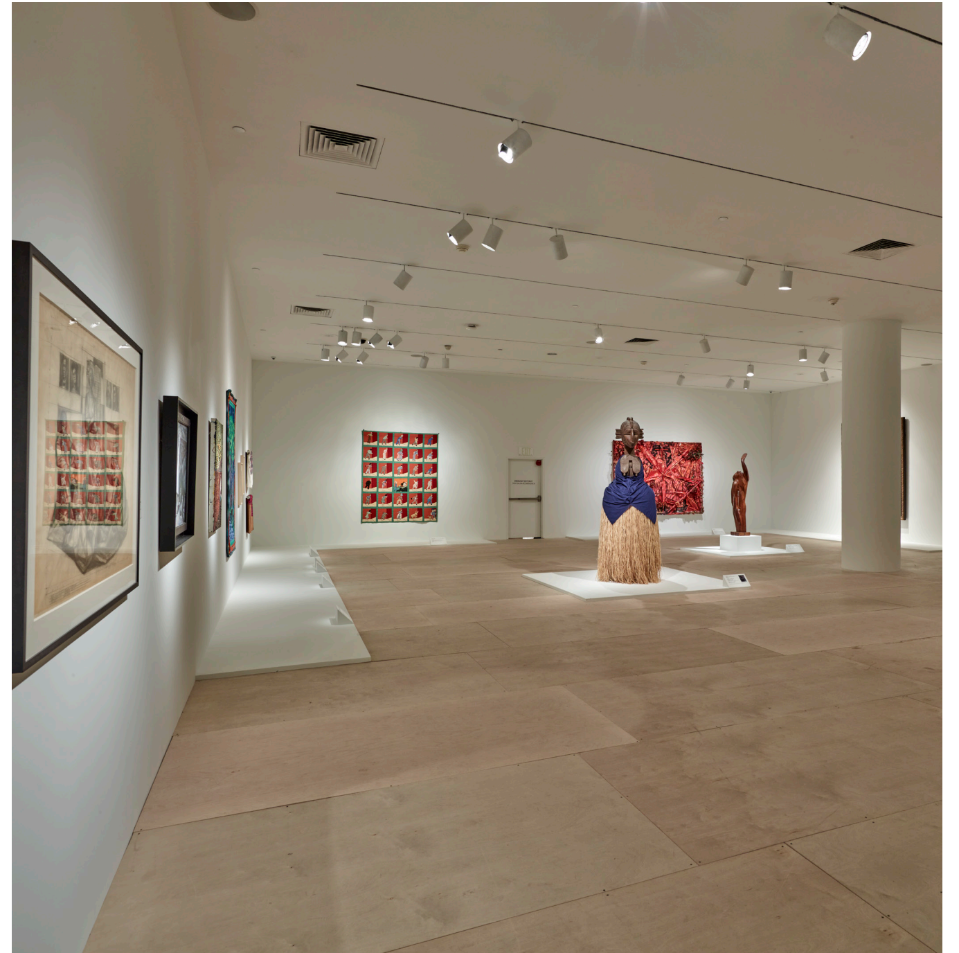
To Be Determined developed during our closure through collaboration among our entire curatorial team. Featuring works from every department of our collection, the exhibition showed how, across history, art has conveyed hope and resilience.