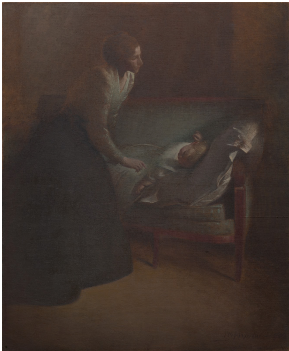
John White Alexander, La Mere , 1900