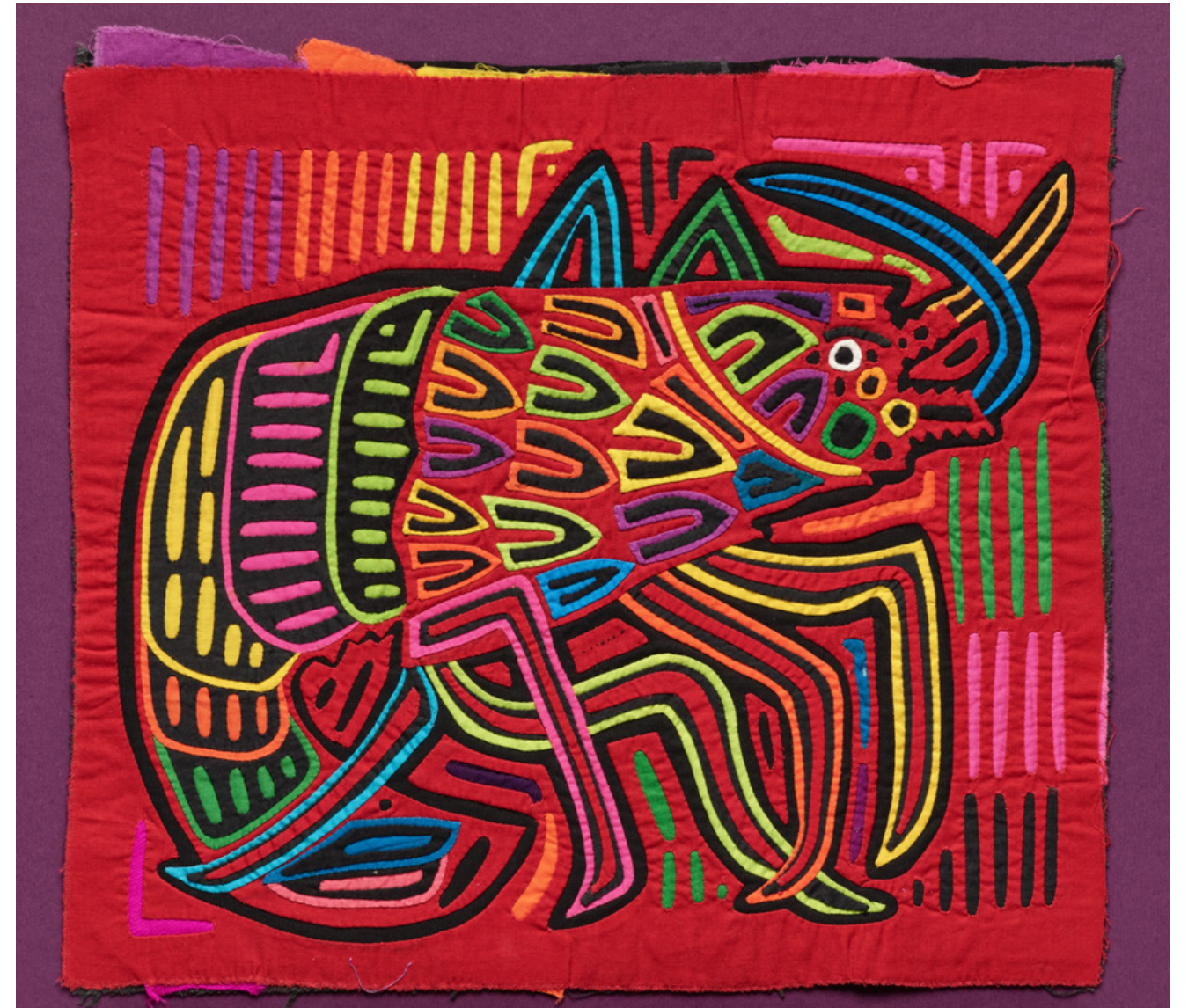
Gunayala Comarca, Panama, Guna people, Hermit Crab Mola Panel , 1953–1975