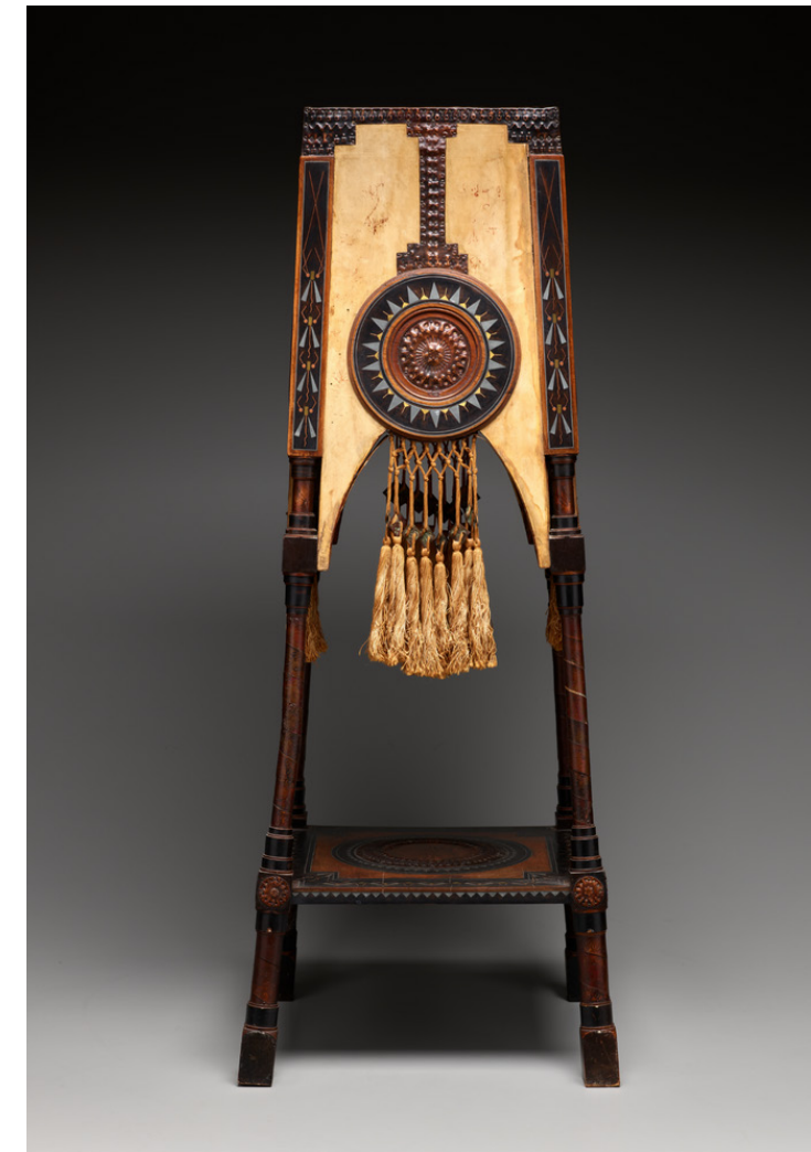
Carlo Bugatti, Pedestal , about 1900