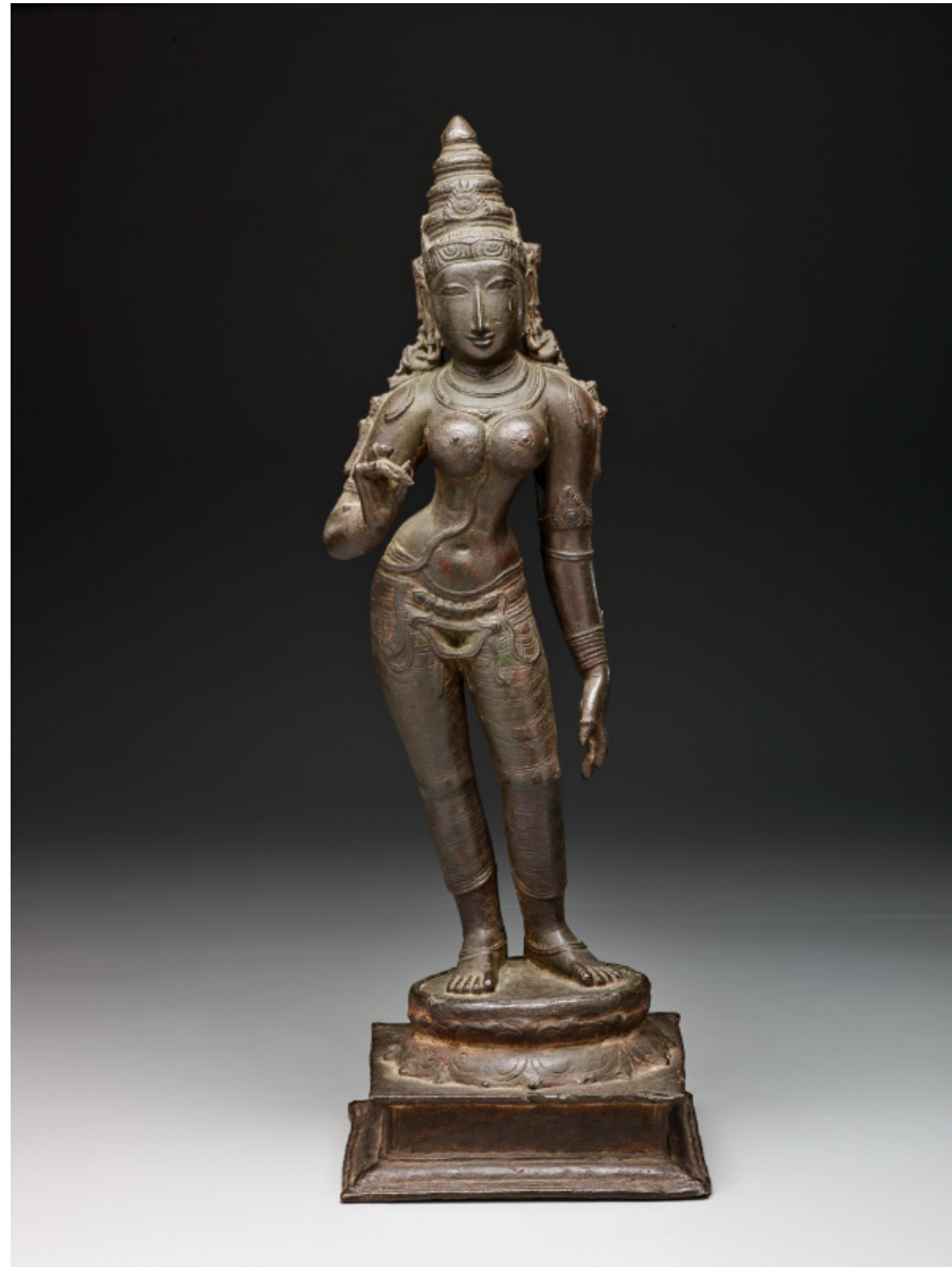
Parvati, about 12th century